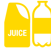
Plastic bottles and containers